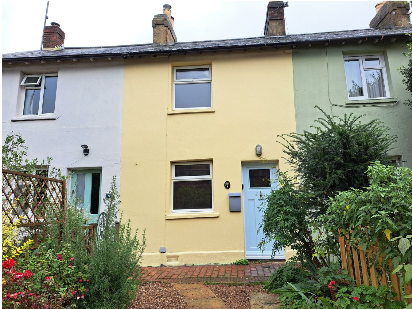
English's Passage, Lewes